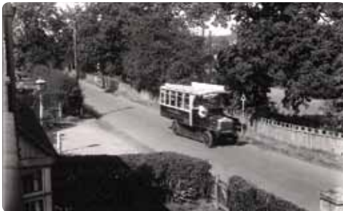
The Oakway prior 1924

The Oakway flourished, particularly with the development of the "Newlands" estate in the 1920s and 30s. Every type of shop you needed for daily life was represented here and businesses that started in The Terrace (between the Post Office and NatWest Bank) transferred to The Oakway as soon as there was a vacancy.