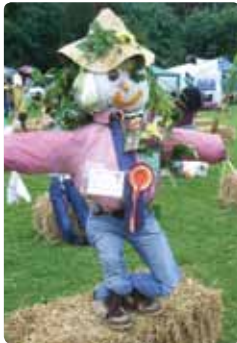
Scarecrows at the Radlett Festival